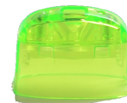
A mouthpiece that activates the device