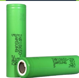
A lithium-ion battery (rechargeable or not)