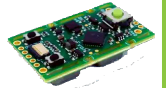
A microprocessor switch and an LED