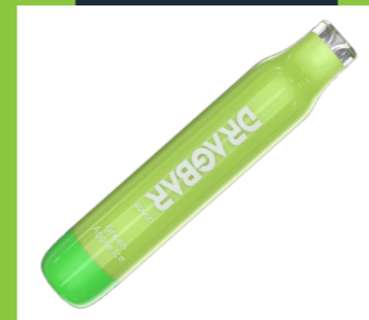
A plastic and / or glass and / or metal casing