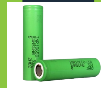
A lithium-ion battery (rechargeable or not)