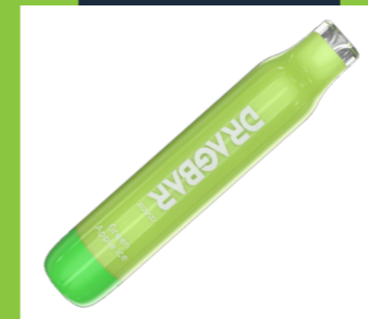
A plastic and / or glass and / or metal casing