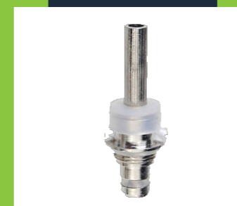
A heating element