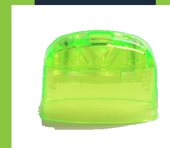
A mouthpiece that activates the device