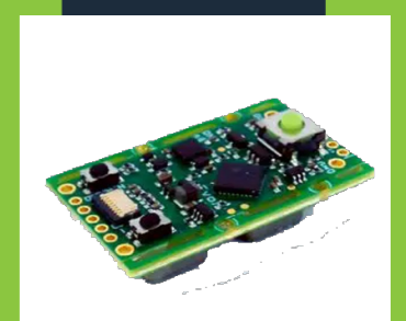
A microprocessor switch and an LED